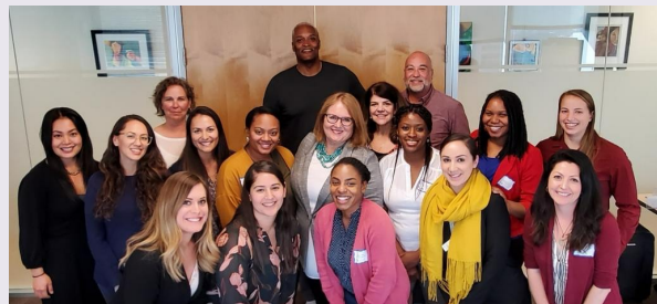
FACES for the Future Coalition Retreat