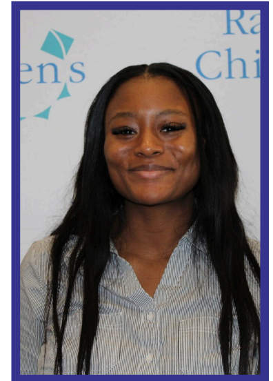
FACES Class of 2022

As a mother to a wonderful baby, balancing school and parenting has its challenges, but it has also been incredibly motivating. I'm currently in the online portion of the program, and I'll begin my externship in October. Ideally, I would love to complete my externship in a setting that involves working with children, although I'm still researching options and keeping an open mind.