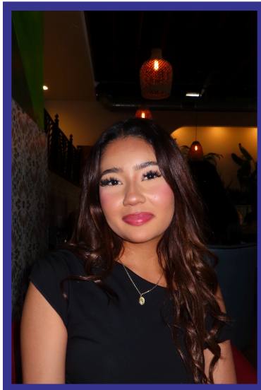
FACES Class of 2023

My experience in the Certified Nursing Assistant (CNA) program with the Nile Sisters has been truly amazing. I learned so much and now feel a step closer to achieving my goal of becoming a nurse. I am deeply grateful to FACES for the Future San Diego and Rady Children's Hospital for awarding me the scholarship that made this possible. This opportunity has been life-changing, and I will forever be thankful for the chance to advance my career in healthcare.